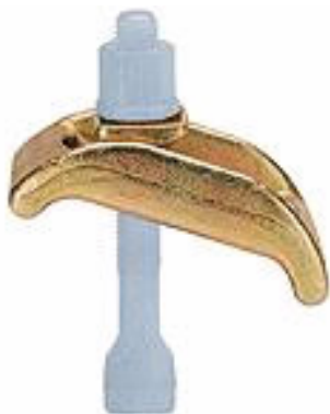
No. 6313K Clamp short, with saddle

Take advantage of the stepless adjustability of our clamps to mount your test fixtures to your base plates. No more shimming necessary!