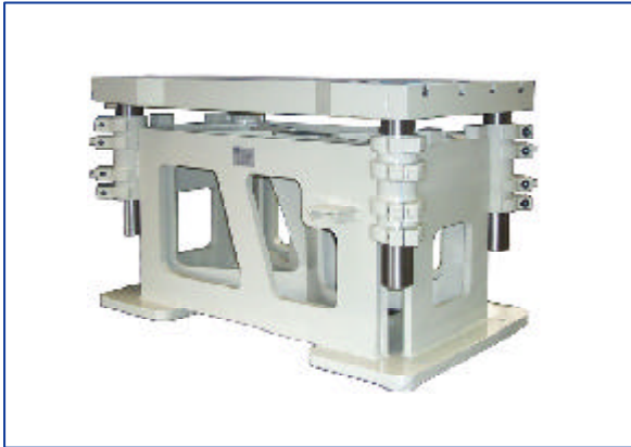
Ex.: Elevating table with manual handling