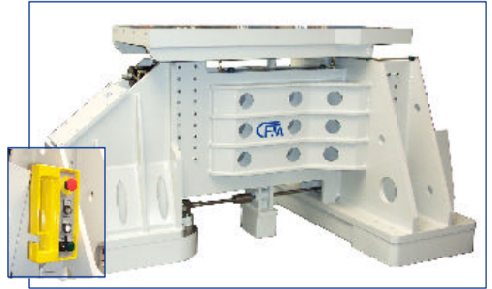
Ex.: Elevating table with automatic lifting and clamping unit

The elevating table to support our standard axle fixture type EAB II is a steel weldment. Its surface is galvanized, primed and lacquered. In order to adjust it to different axle centerpoints, it consists of a fixed base frame and a separate, height-adjustable table top.