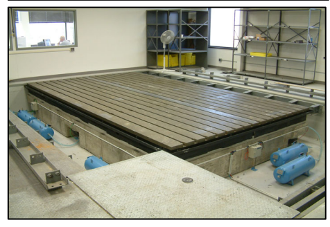
CFM ITBONA LLC 4282 SHORELINE DRIVE SPRING PARK, MN 55384, USA